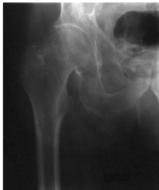
Garden I femoral neck fracture